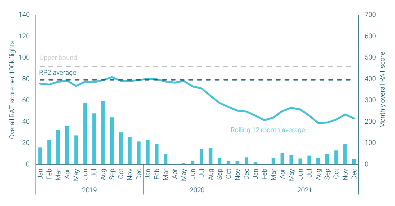
En route overall RAT score per 100k movements

As noted above, in NR23, we aim to maintain or reduce the number of overall RAT points relative to an appropriate baseline that takes account of the growing traffic levels in NR23.